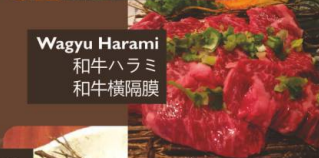
Wagyu Harami 和牛ハラミ 和牛横隔膜