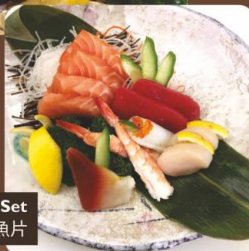
Sashimi Set 刺身 生魚片