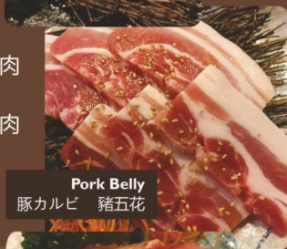
Pork Belly 豚カルビ 猪五花