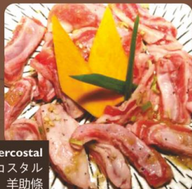
Lamb Intercostal ラム インタコスタル 羊助條