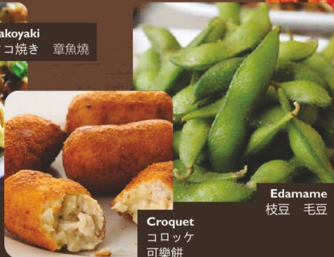
Edamame 枝豆 毛豆