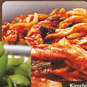
Kimchi キムチ 韓式泡菜