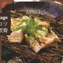
Chicken Cartilage とり ナンコツ 雞軟骨