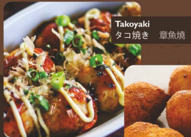
Takoyaki タコ焼き 章魚燒